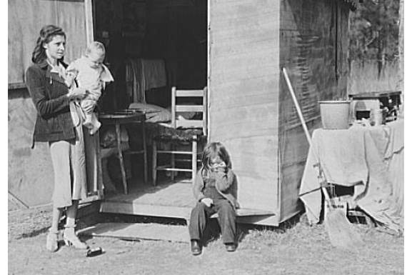
Family of construction worker, Monroe, LA, 1940.